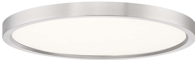
Brushed nickel (BN)