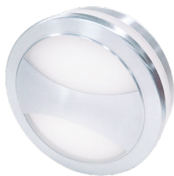
-5S New Moon