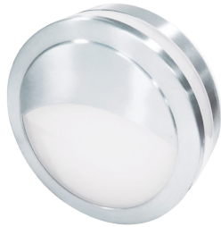
-3S Half Moon