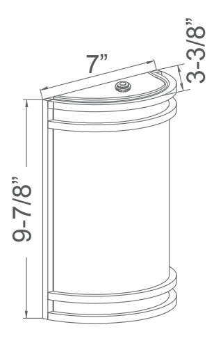
Brushed Aluminum (BA)