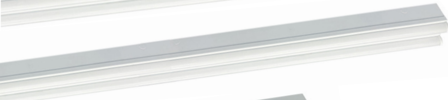
4310-1 Double Tube