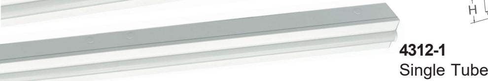
4312-1 Single Tube