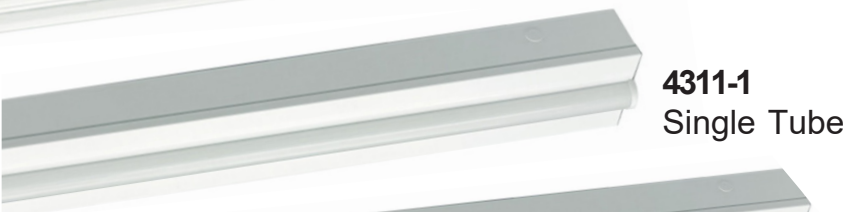
4311-1 Single Tube